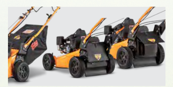
Capable of 3-in-1 versatility, giving you the ability to mulch, bag or side-discharge. Mulching and bagging attachments come standard; side-discharge accessory is available.

Strong, stamped steel deck ensures years of worry-free performance and a consistent cut. Replaceable side wear protection.