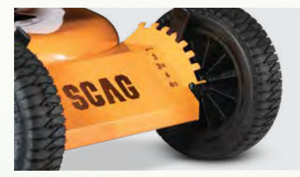
Easy height-of-cut adjustment allows for cutting heights from 1.5" to 4.5" in .5" increments.

Strong warranty: 1-Year Commercial or 3-Year Non-Commercial limited warranty coverage against manufacturing defects.