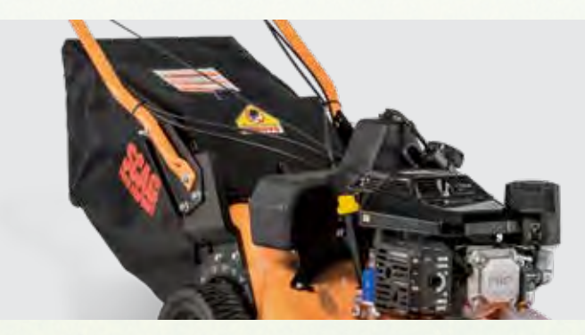
A 2.2-bushel (2.74 cu. ft.) grass catcher comes standard for convenient clipping collection when needed or preferred.