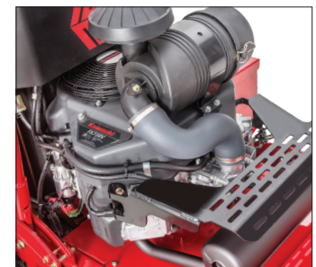
Venom | Kawasaki Engine