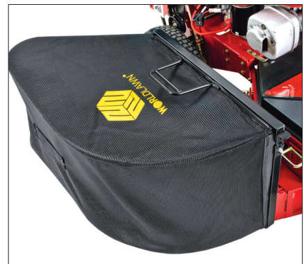
Walk Behind | Grass Catcher