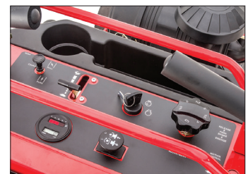
Venom | Control Panel

3 YEAR PARTS & LABOR LIMITED DECK 10 WARRANTY