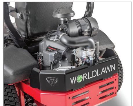
King Cobra Maxx | Engine View

3 YEAR PARTS & LABOR LIMITED DECK 10 YEAR WARRANTY