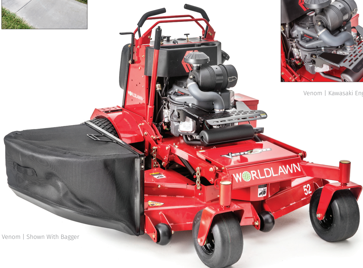
Venom | Shown With Bagger