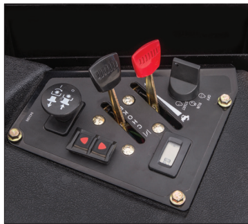
Python | Control Panel