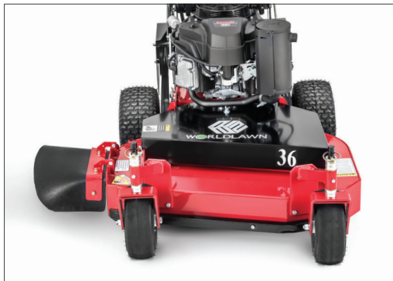
BELT SERIES | Front View