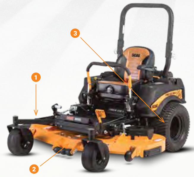
Available in standard Cat's Eye Gold or new Blackout paint scheme. Blackout paint scheme is exclusive to the models equipped with Kohler® Command PRO® engines.*