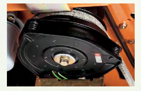
Heavy-duty Ogura GT3.5 clutch features 250 ft lb of holding strength. Adjustable air gap for long life.