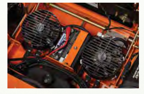
Rugged 12 cc hydraulic pumps feature pressure-relief valves and top-mounted fans for added reliability and longer life.