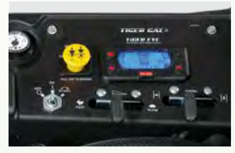
Operator-friendly instrument panel includes the Tiger Eye™ Advanced Monitoring System, which keeps a constant, real-time "eye" on important system functions of the Tiger Cat II. (Specific functions vary by mower model and engine.)