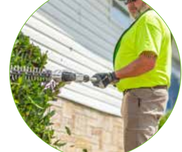
Ultra Lightweight Weighs Only 9.2 lbs.

Laser-Cut, Stainless-Steel Heat-Treated Blades For Easy & Precise Cutting of up to 1.2" Branches