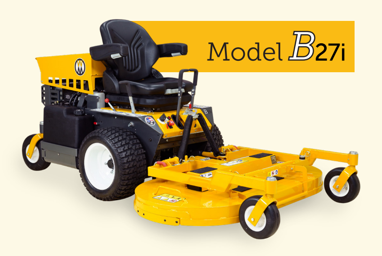
26.5 HP Kohler Command Pro ECH749 EFI engine

Mulching 36"-60" (91 cm-152 cm) Discharge 36"-74" (91 cm-188 cm)