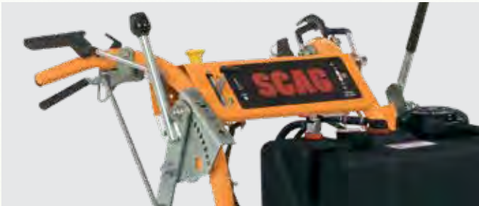
Spring-assisted EZ-Grip design reduces hand force required to operate drive controls for maximum operator comfort.