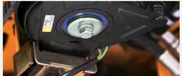
Dependable Ogura clutch engages and disengages the blades quickly and easily. Adjustable air gap for long life.