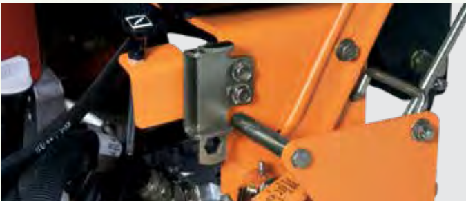
Adjust-A-Trac tool is conveniently mounted on the engine deck for quick and easy neutral and tracking adjustments in the field.