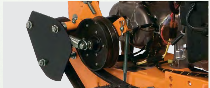
Twin power belts provide double friction to pulley surfaces and reduce slipping in wet conditions.