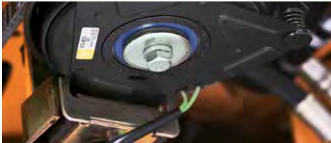
Dependable Ogura clutch engages and disengages the blades quickly and easily. Adjustable air gap for long life.