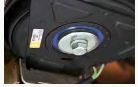
Dependable Ogura clutch engages and disengages the blades quickly and easily. Adjustable air gap for long life.

Dual hydraulic ZT-2800<sup>®</sup> transaxles with cooling fans and steel fan covers allow independent, amazingly smooth and positive power to each wheel; two independent units with charge pumps and all-metal gears. Rear skid plate protects the underside and transaxles from impact damage.